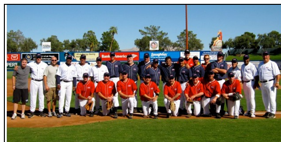
The 2011 Fantasy Campers on Day One at Cashman Field